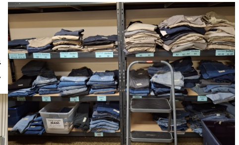
clothing closet at Micah Ministry