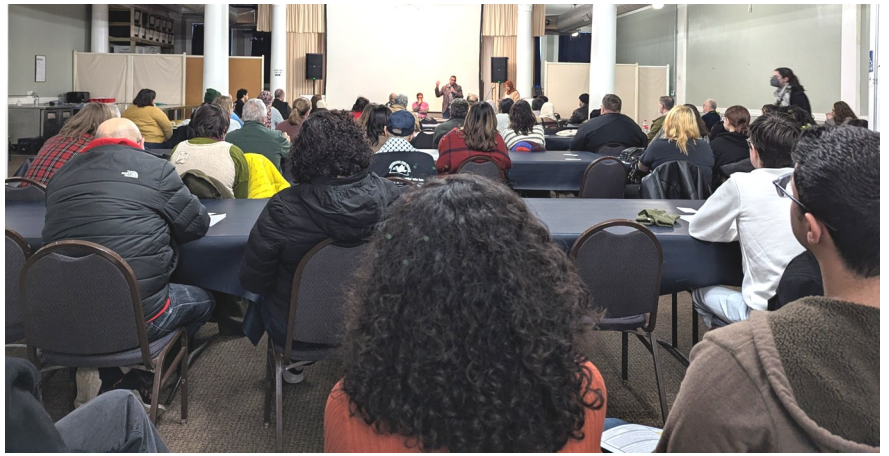
the panel included a Kansas City rabbi, an Israeli Jew, and three Palestinian voices

Donations above the event expenses went to the Kansas-based Palestinian American Medical Association (PAMA).