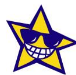
Junior YOUTH GROUP

Junior Youth Group resumes on September 7 from 6-7 p.m. in the Youth Room (basement). We will meet on the 1st and 3rd Wednesdays through the school year. Junior Youth Group is for all children 4th through 6th grade. We will spend time playing games, laughing, studying scripture, and having fun.